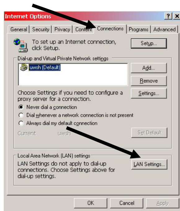
On the Connections tab, choose LAN Settings...

On the Connections tab, click the LAN settings... button and the LAN settings window will appear.