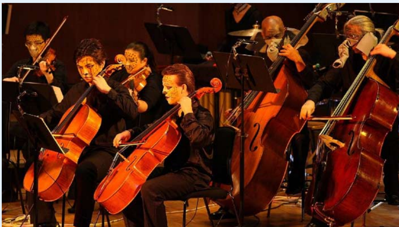
The orchestra playing "The Magic Jungle"