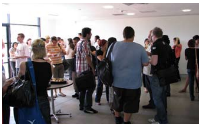
Orientation Day participants chatting at lunch time.