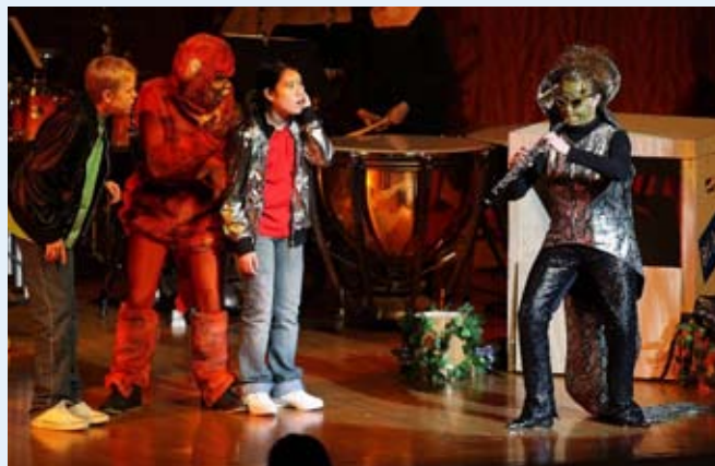
Characters from "The Magic Jungle"